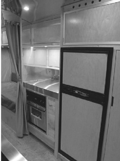
THE LARGE DOOR ABOVE THE REFRIGERATOR HIDES AUDIO EQUIPMENT.