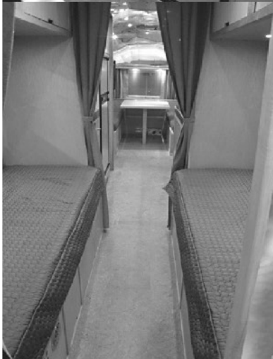
STORAGE ABOVE AND BELOW THE BEDS.